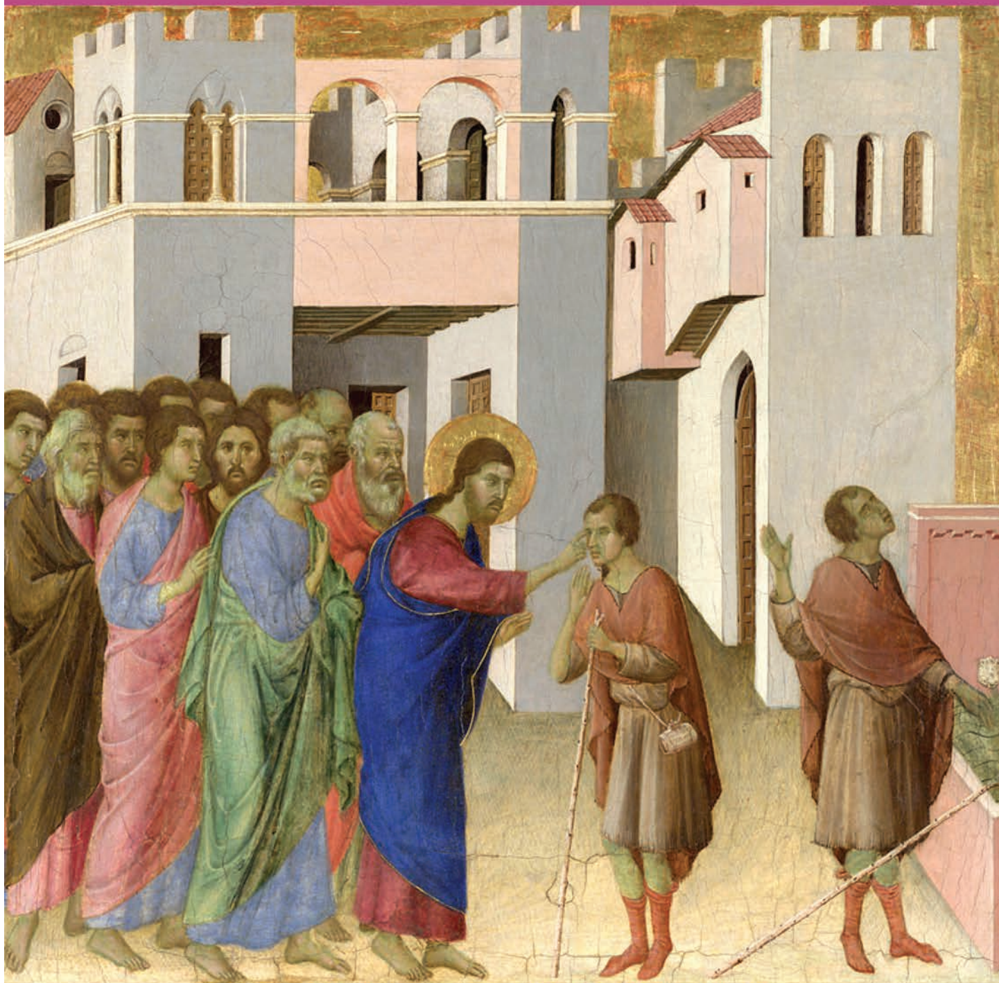
The Healing of the Man Born Blind, Duccio di Buoninsegna (c. 1250/1255 - 1318/1319); National Gallery, London

Jesus said to the blind man: "While I am in the world, I am the light of the world." When he had said this, he spat on the ground and made clay with the saliva, and smeared the clay on his eyes, and said to him, "Go wash in the Pool of Siloam." So he went and washed, and came back able to see.