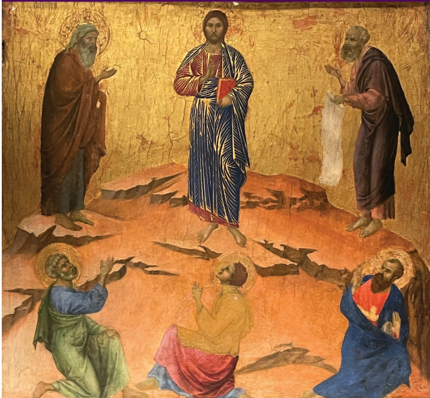
The Transfiguration of Christ, Duccio di Buoninsegna (c. 1250/1255 - 1318/1319); National Gallery, London

Jesus took Peter, James, and John, and led them up a high mountain by themselves. And he was transfigured before them; his face shone like the sun and his clothes became white as light. And behold, Moses and Elijah appeared to them, conversing with him.