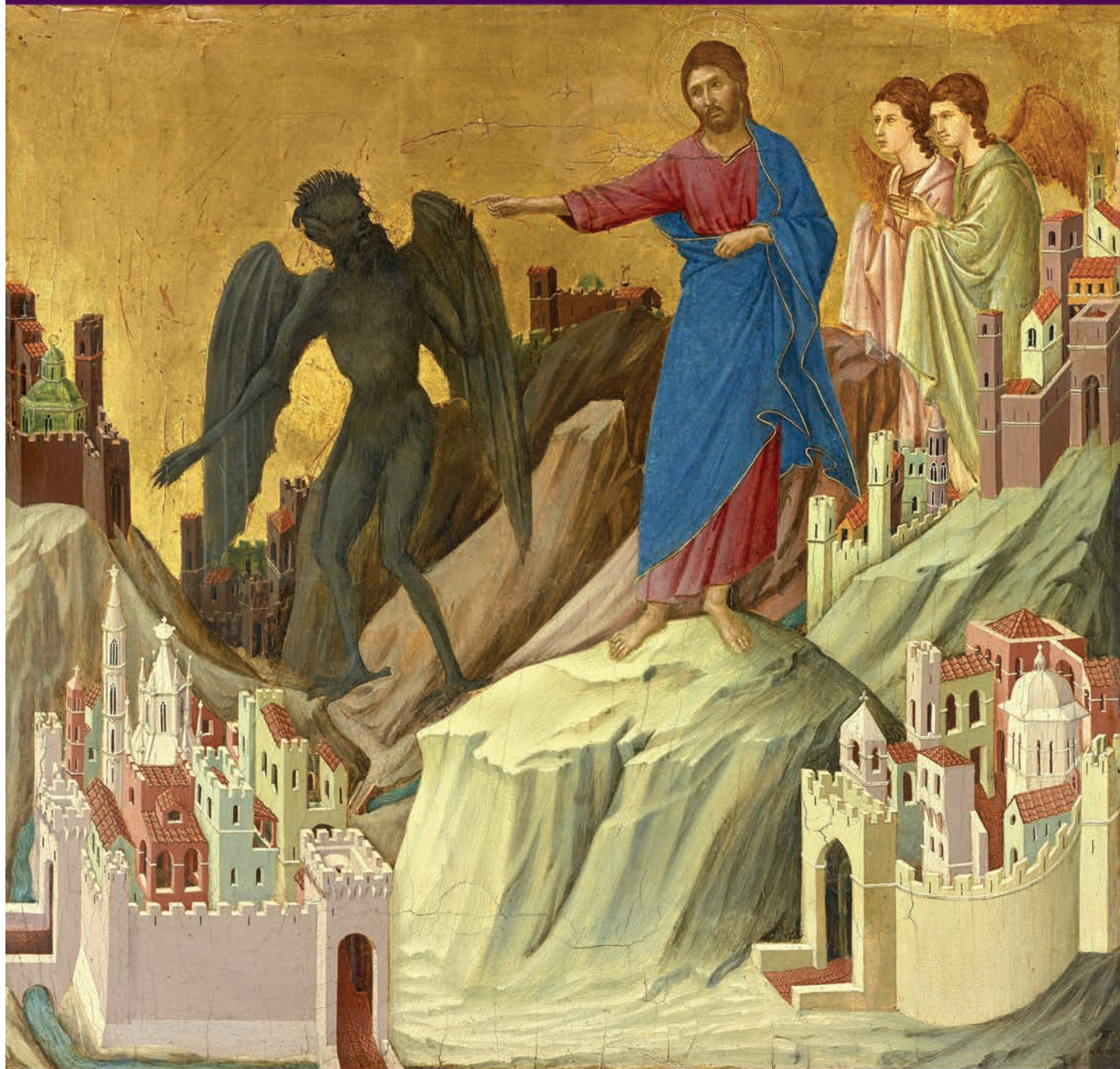
The Temptation of Christ on the Mountain, Duccio di Buoninsegna (c. 1250/1255 - 1318/1319); The Frick Collection, NY

The devil took Jesus up to a very high mountain, and showed him all the kingdoms of the world in their magnificence, and he said to him, "All these I shall give to you, if you will prostrate yourself and worship me." At this, Jesus said to him, "Get away, Satan!"