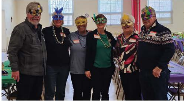
Parishioners from Sacred Heart Parish in Suffield participate in the mask-making activities during last year's Mardi Gras celebration to kick off the Lenten season.

As winter lingers and Lent approaches, Sacred Heart Parish in Suffield is once again inviting parishioners to gather for a joyful celebration that brings the community together before the reflective season begins. On Feb. 15, following the 10:30 a.m. Mass, parishioners are encouraged to head to the church hall for the second annual Mardi Gras celebration—a lively afternoon of food, music and fellowship.