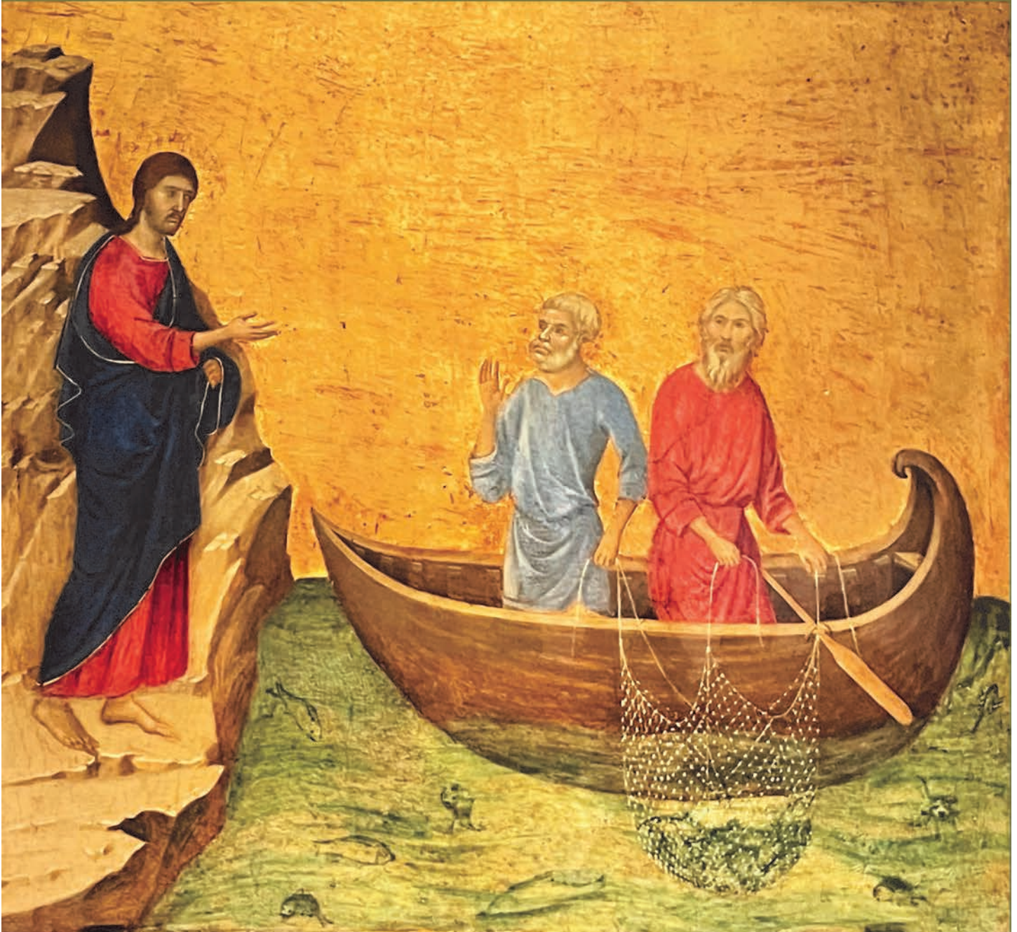
The Calling of the Apostles Peter and Andrew, Duccio di Buoninsegna (c. 1250/1255 - 1318/1319); National Gallery of Art, Washington, DC

As he was walking by the Sea of Galilee, Jesus saw two brothers, Simon who is called Peter, and his brother Andrew, casting a net into the sea; they were fishermen. He said to them, "Come after me, and I will make you fishers of men."