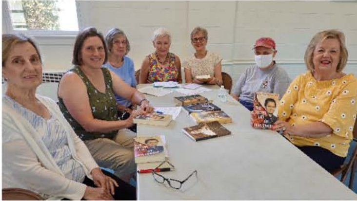
Some members of the Catholic book club at Holy Infant Parish in Orange gather at the church for their bimonthly discussion.