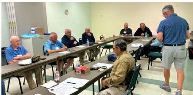
Members at their monthly meeting at St. Agnes Church.