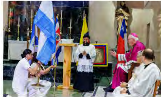
As the celebration moves indoors, each participating group processes into the church with a representative image of the Blessed Mother and the flag of their country with their national anthem playing the background. Archbishop Christopher J. Coyne blesses the images of Our Lady as they are presented to him.

More than 800 people representing 12 countries came together for the fourth annual Mary of the Americas celebration in a display of faith, unity and cultural pride. There was prayer, there was pageantry and there was a festival of Latin American food.