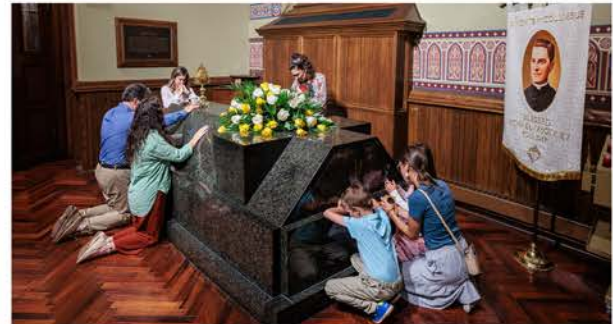
People can invoke the intercession of Blessed McGivney at his tomb in St. Mary Church in New Haven, part of Blessed Michael McGivney Parish. His remains are placed in a sealed, double bronze coffin within a polished granite sarcophagus at the rear of the church.