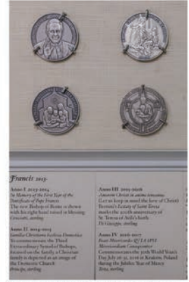
Coins highlighting the pontificate of Pope Francis on display.

The Blessed Michael McGivney Pilgrimage Center in New Haven is welcoming visitors to view a permanent gallery that highlights the relationship between the Knights of Columbus, Pope Francis and other pontificates.