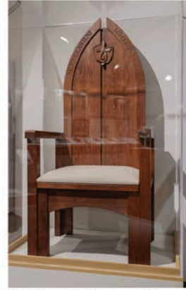
This Papal Chair was used by Pope Francis during the 2016 World Youth Day in Krakow, Poland.