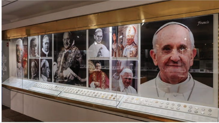
The Papal Gallery, inside the Blessed Michael McGivney Pilgrimage Center, includes a permanent exhibit related to popes. At right is a photograph of Pope Francis.