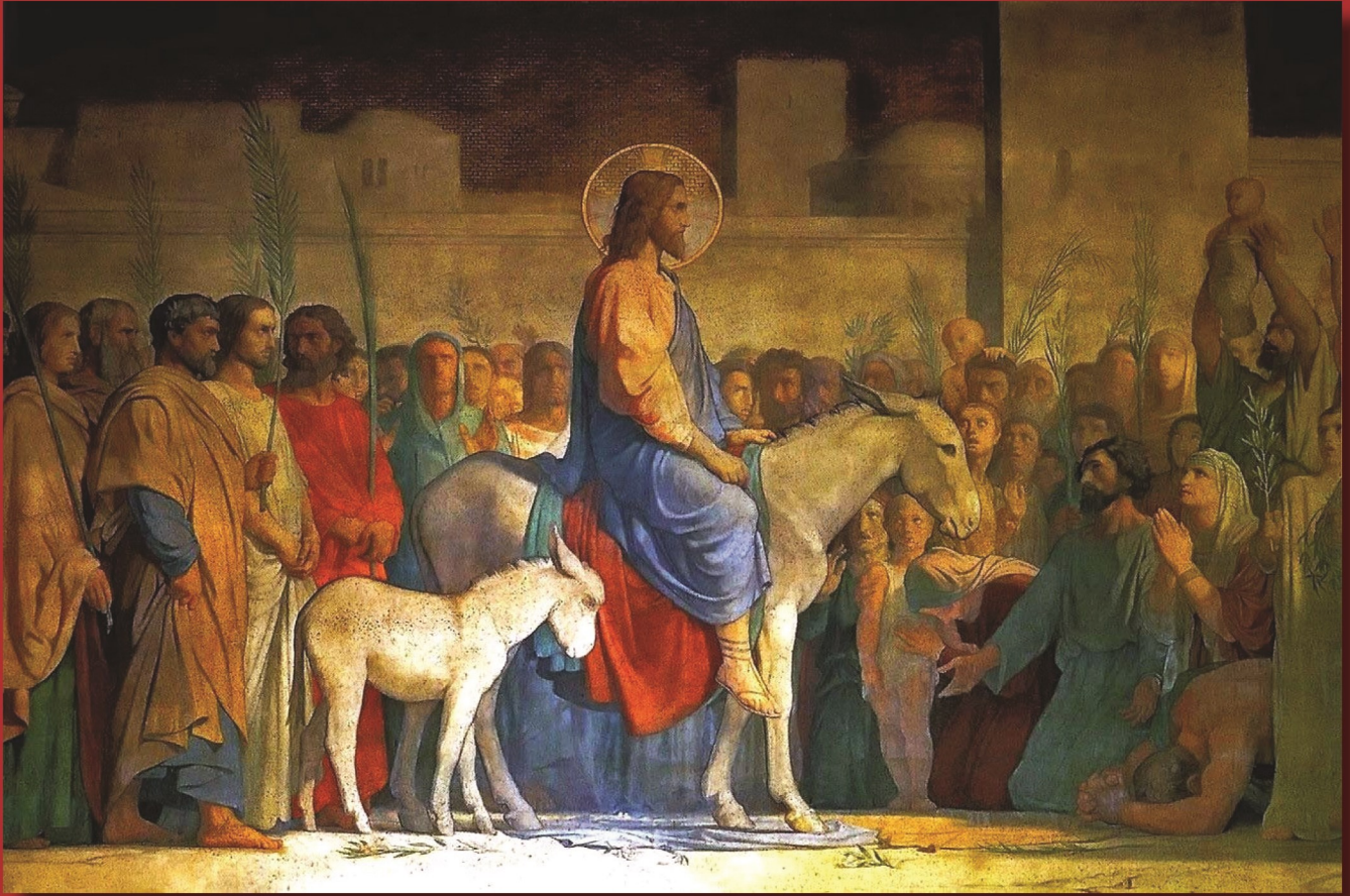
Christ's Entry into Jerusalem by Hippolyte Flandrin c. 1842

Hosanna to the Son of David; blessed is he who comes in the name of the Lord, the King of Israel. Hosanna in the highest!