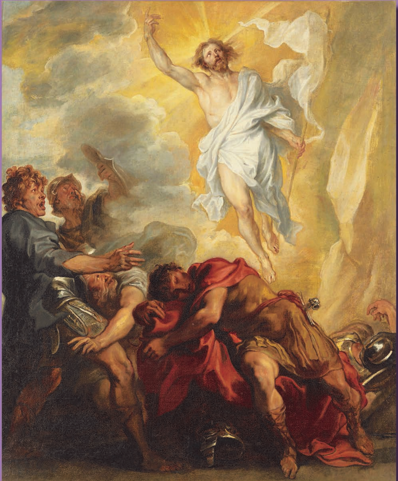
The Resurrection by Anthony van Dyck (1599-1641); Wadsworth Atheneum, Hartford

St. Patrick-St. Anthony Church • 285 Church Street • Hartford, Connecticut April 20, 2025 • Easter Sunday of the Resurrection of the Lord