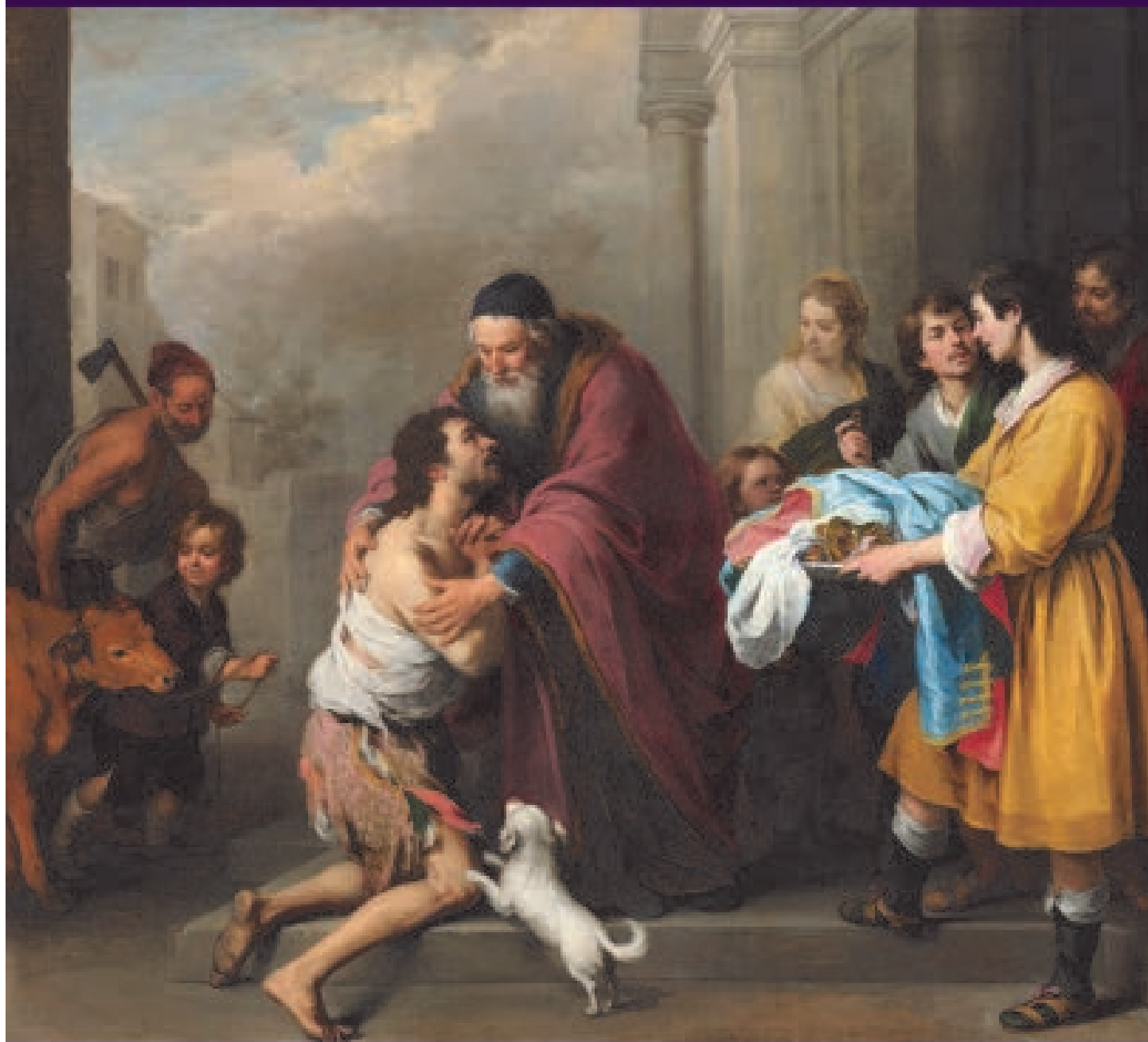
The Return of the Prodigal Son by Bartolomé Estéban Murillo, National Gallery of Art, Washington, DC

"We must celebrate and rejoice, because your brother was dead and has come to life again; he was lost and has been found."