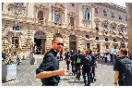
Three Archdiocesan seminarians and priests are in Rome for a special day of discernment for the Archbishop's Appeal for 2025.