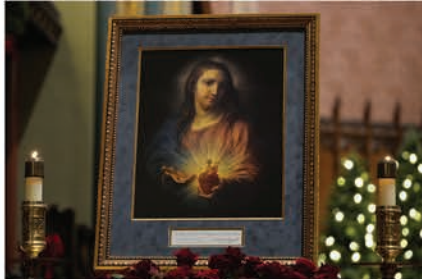
The new Knights of Columbus Sacred Heart traveling pilgrim icon was on display for veneration before the Jan. 3 Mass at St. Mary Church, part of Blessed Michael McGivney Parish.