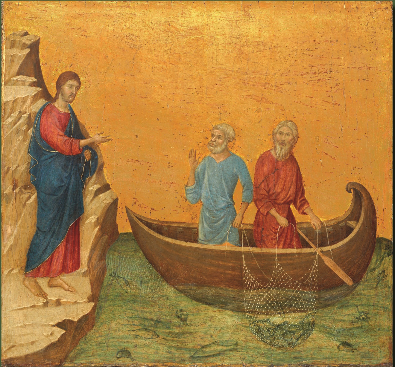
The Calling of the Apostles Peter and Andrew, 1308-1311 by Duccio di Buoninsegna; National Gallery of Art, Washington, DC

February 9, 2025 • Fifth Sunday in Ordinary Time St. Patrick-St. Anthony Church • 285 Church Street • Hartford, Connecticut