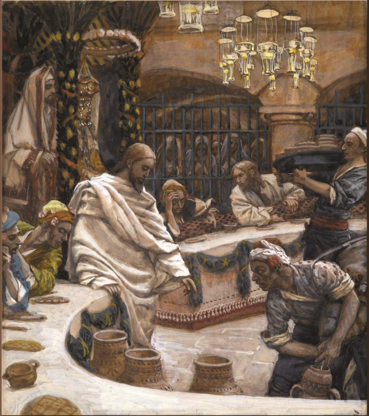
The Wedding at Cana by James Tissot (1836-1902); Brooklyn Museum

January 19, 2025 • Second Sunday in Ordinary Time St. Patrick-St. Anthony Church • 285 Church Street • Hartford, Connecticut