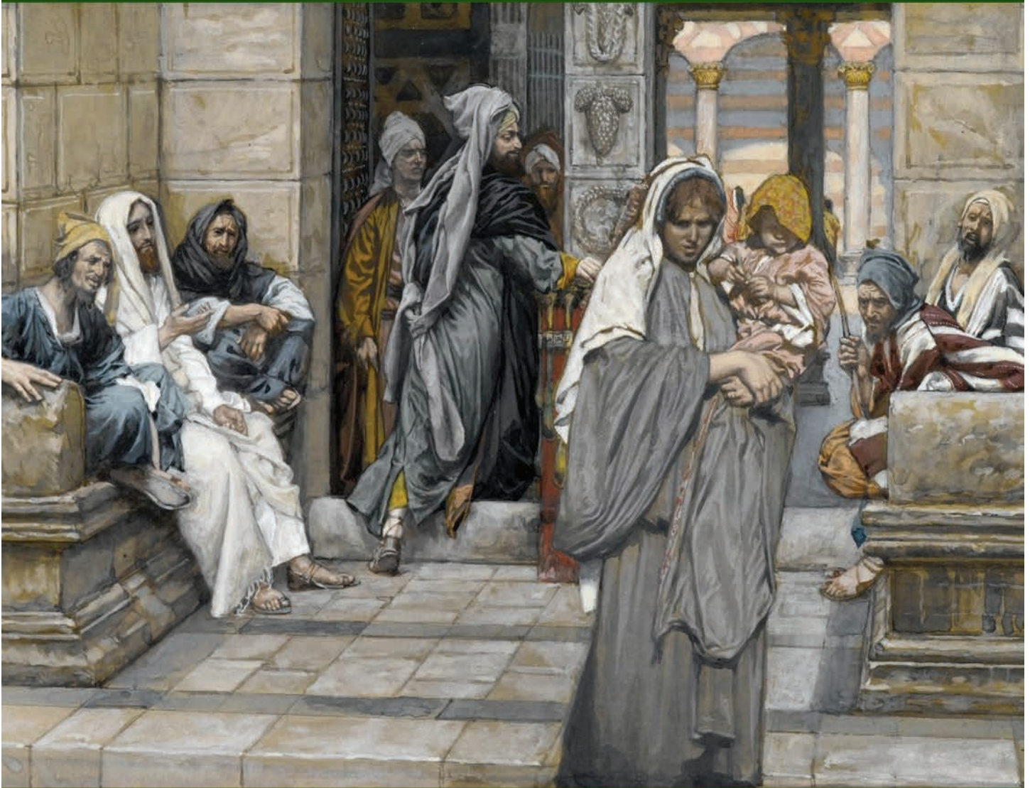
The Widow's Mite by James Tissot (1836-1902); Brooklyn Museum

“Amen, I say to you, this poor widow put in more than all the other contributors to the treasury. For they have all contributed from their surplus wealth, but she, from her poverty, has contributed all she had, her whole livelihood.”