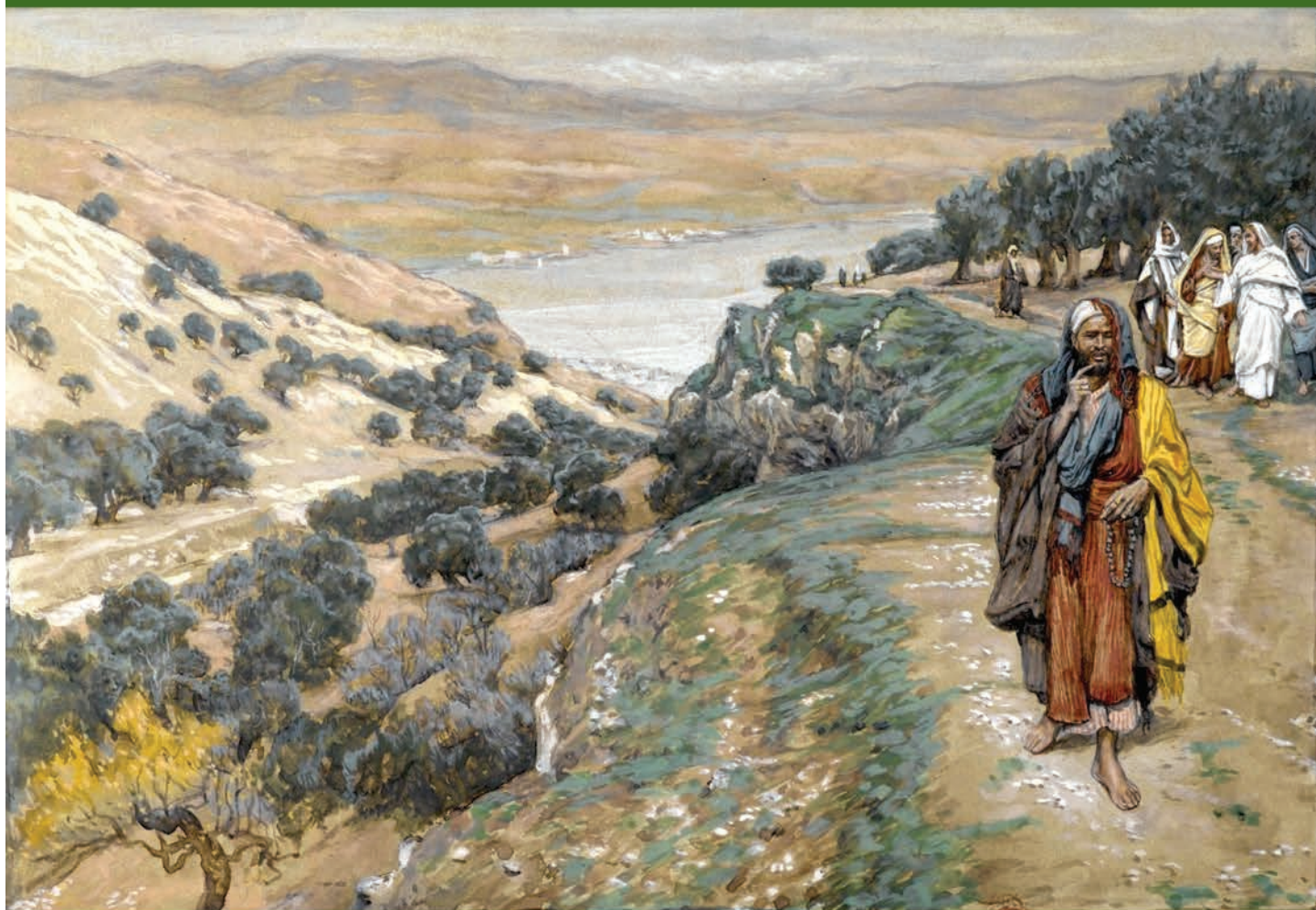
The Rich Young Man Went Away Sorrowful by James Tissot (1836-1902); Brooklyn Museum

Jesus, looking at him, loved him, and said to him, “You are lacking in one thing. Go, sell what you have, and give to the poor and you will have treasure in heaven; then come, follow me.” At that statement his face fell, and he went away sad, for he had many possessions.”