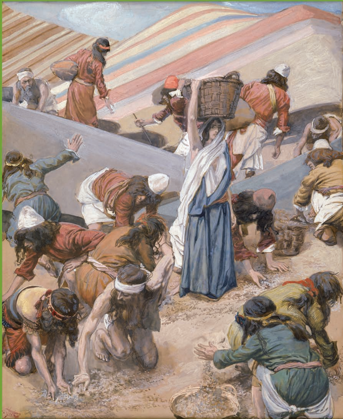
The Gathering of the Manna by James Tissot (1836-1902), The Jewish Museum, New York

“Amen, amen, I say to you, it was not Moses who gave the bread from heaven; my Father gives you the true bread from heaven.”