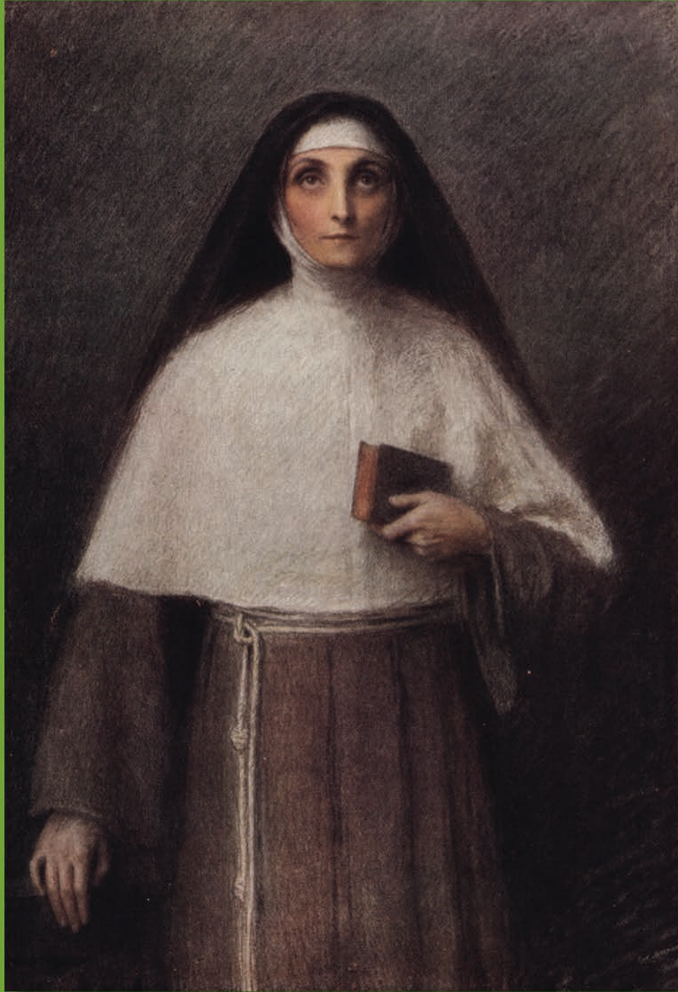
Saint Clare by Eugene Burnand (1850-1921)

St. Patrick-St. Anthony Church • 285 Church Street • Hartford, Connecticut August 11, 2024 • Nineteenth Sunday in Ordinary Time Feast of Saint Clare of Assisi