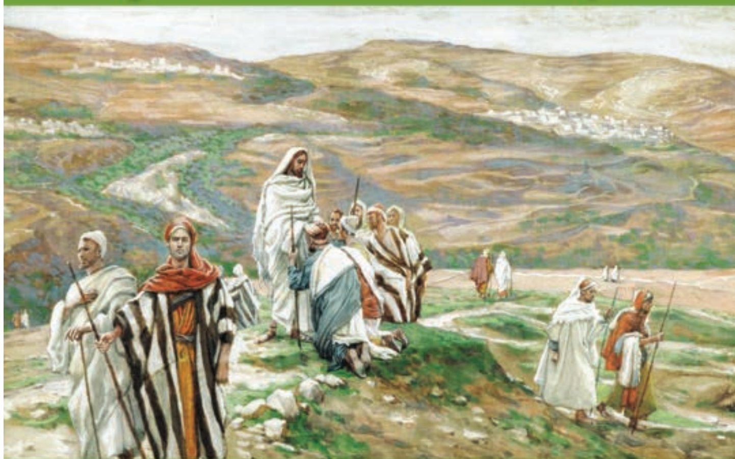
He Sent Them Out Two by Two by James Tissot (1836-1902) Brooklyn Museum

Jesus summoned the Twelve and began to send them out two by two...