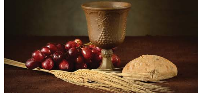
"Source and Summit, Sacrifice and Supper: The Meaning of the Eucharist"

Works by Palestrina, Mozart, Bruckner, Howells and others