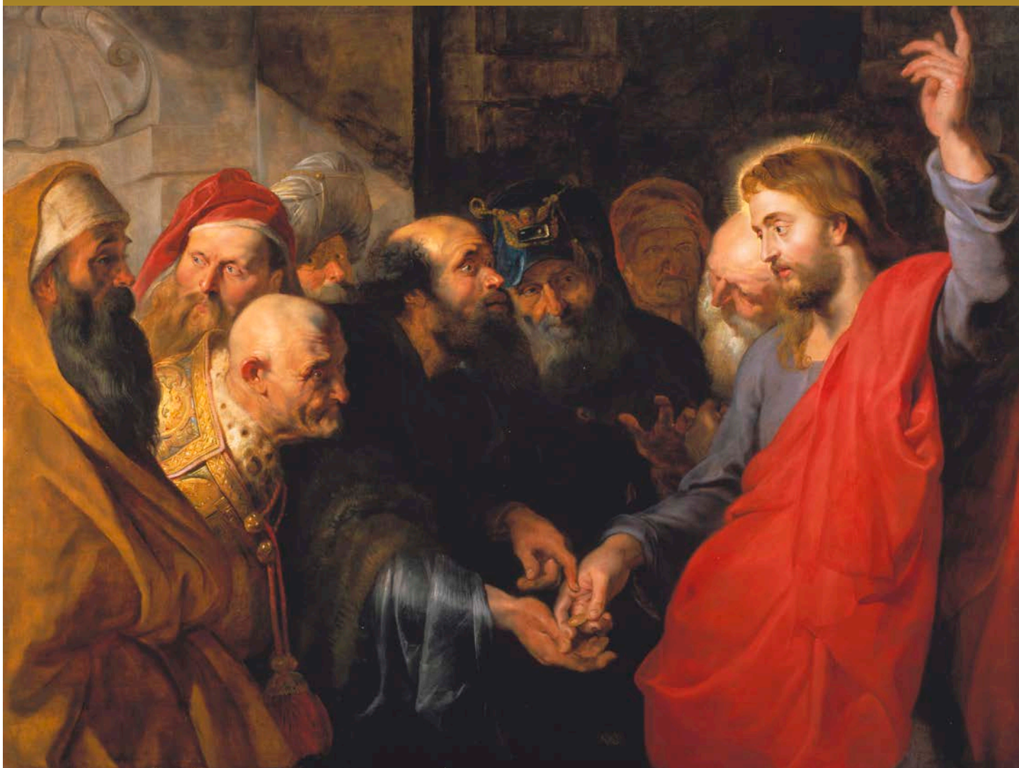
The Tribute Money, Peter Paul Rubens, 1577-1640

Repay to Caesar what belongs to Caesar and to God what belongs to God.