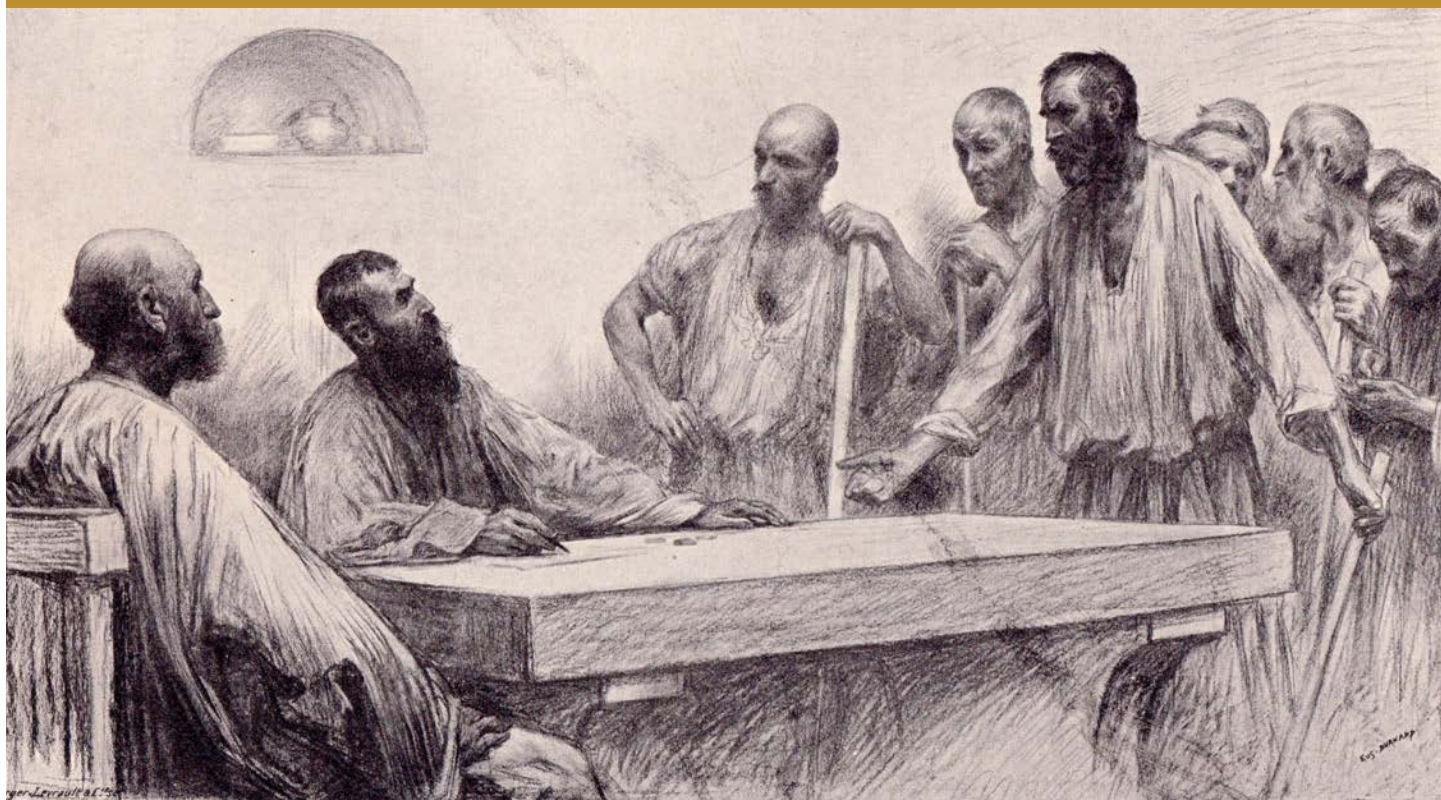
Les ouvriers dans la vigne (The workers in the vineyard) by Eugène Delacroix, 1850-1921

Take what is yours and go. What if I wish to give this last one the same as you? Or am I not free to do as I wish with my own money? Are you envious because I am generous? Thus, the last will be first, and the first will be last."