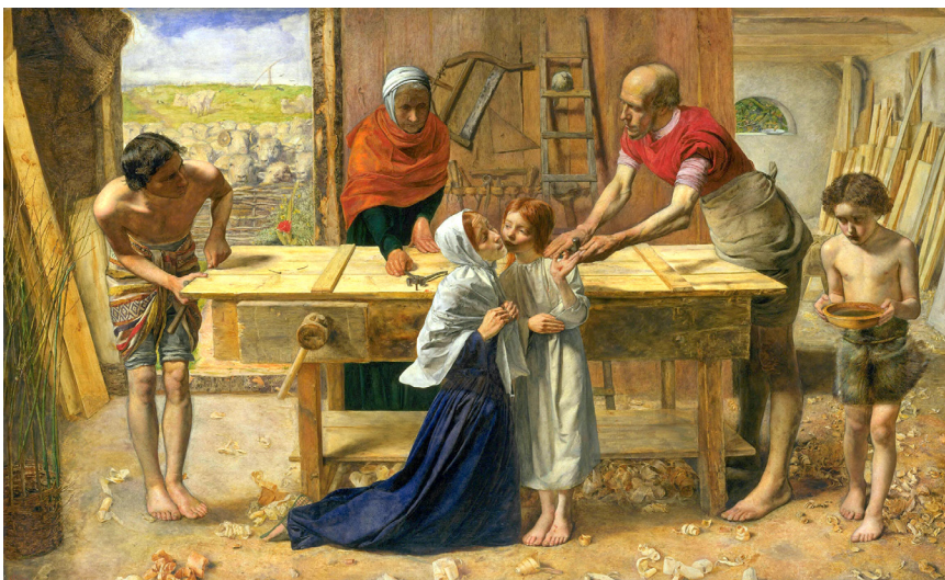
Christ in the House of His Parents ('The Carpenter's Shop') by John Everett Millais (1829-1896)

We invite you to a reception hosted by the St. Patrick-St. Anthony Open Hearts LGBTQ+ Ministry in the Franciscan Center for Urban Ministry immediately following the conclusion of this service.