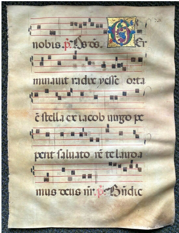
The 14th century parchment folio of the antiphon: "Germinavit radix Jesse; orta est stella ex Jacob; Virgo peperit saluatorum; te laudamus, Deus noster."