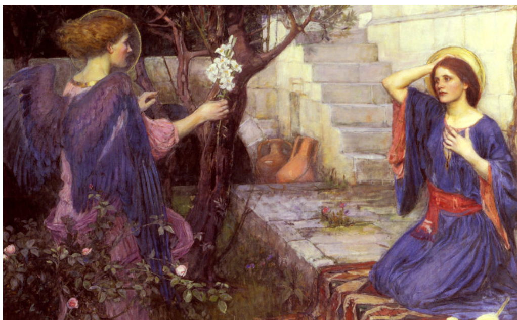
"The Annunciation" by John William Waterhouse (1849-1917)