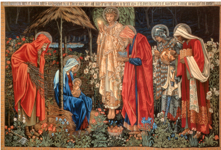
"The Star of Bethlehem" by Edward Burne-Jones (1833-1898)

Text: Matthew 2:1-2; Numbers 24:17; Psalm 2:9 and Wie schön leuchtet der Morgenstern Music: Felix Mendelssohn Bartholdy, 1809-1847